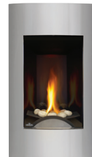
Contemporary Facing Kits Available in Painted Black and Brushed Stainless Steel (shown on left)