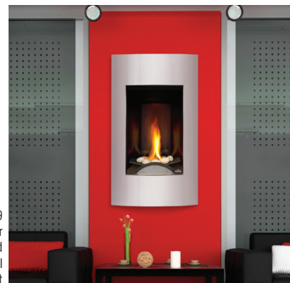
Right and Cover: GD19 with River Rock burner configuration and Brushed Stainless Steel contemporary facing kit