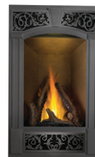
Traditional Facing Kits Traditional facing kits available in Painted Metallic Black (shown on left with painted metallic black ornamental insets) and Hammertone Pewter